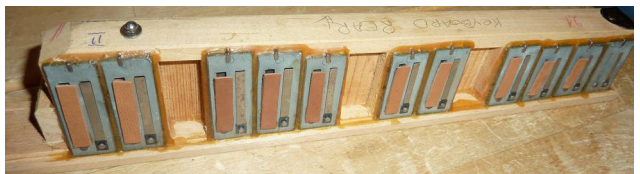
Treble Reed Blocks