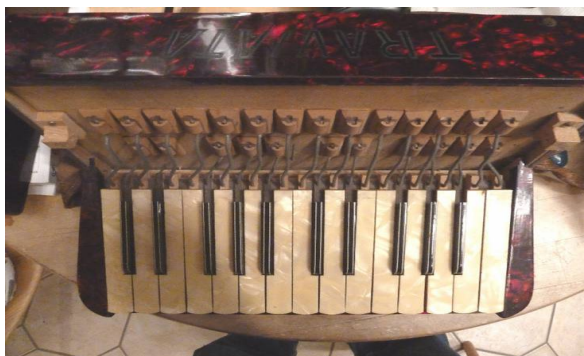
Keyboard and valves