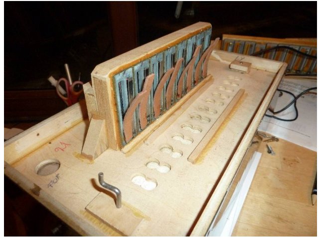
Bass Reed Blocks