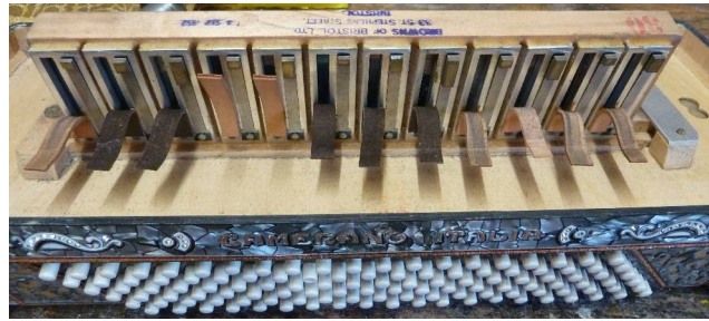
Bass reeds other side