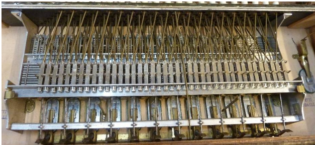
Bass Button Mechanism