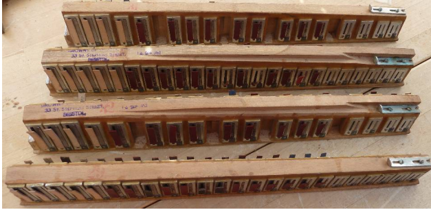
Treble Reed blocks