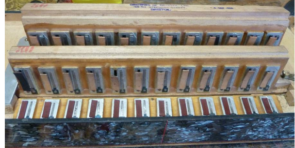
Bass Reed Blocks