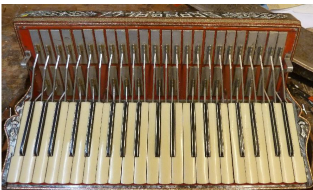
Keyboard and valves