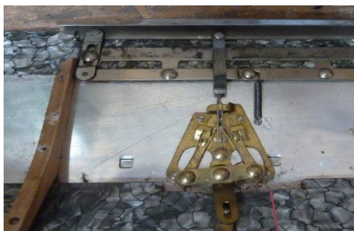
Voice Switch Mechanism