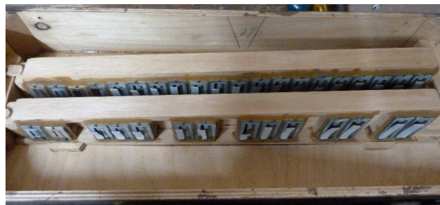
Treble Reed Blocks