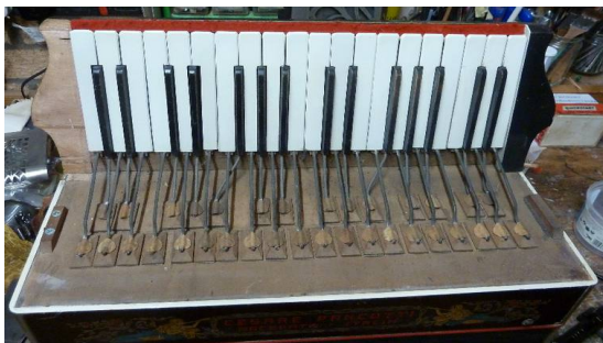
Keyboard and valves