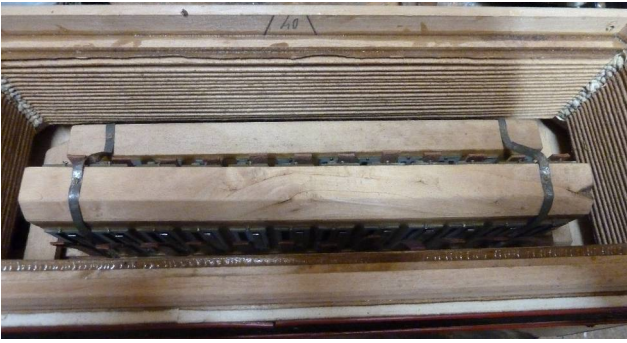
Bass Reed Blocks