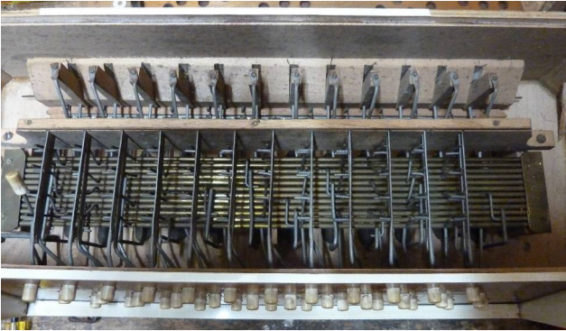
Bass Button Mechanism