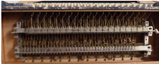
Bass Button Mechanism