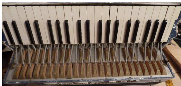
Keyboard and valves