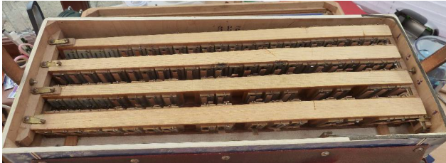
Treble Reed blocks